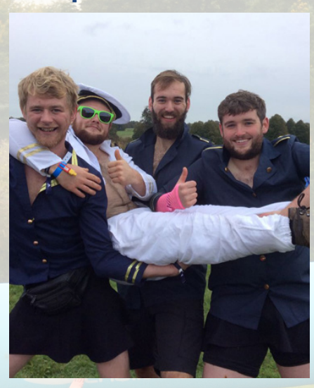
Still Single Virgins Open To Offers South Derbyshire Network Derbyshire