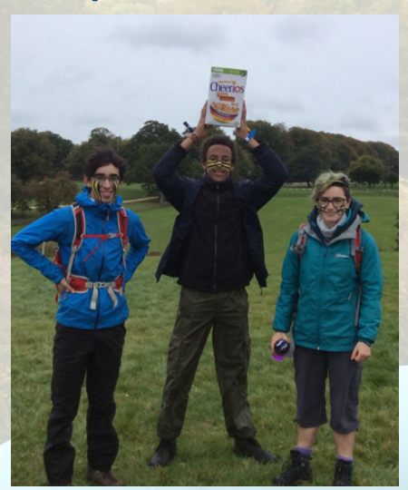
Honey Nut Cheerios

Chorlton Bees ESU (Greater Manchester East)